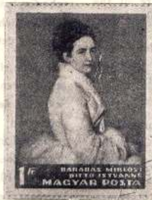
C 30 Hungary Art Giant Size 3 values Re. 1.00