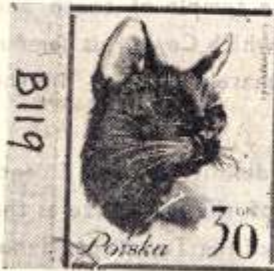
B 119 Poland 3 values -/40