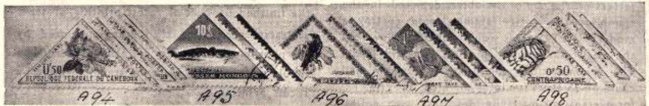
A 94 Cameroun 4 values -/40

are offered every month in CEYLON STAMP NEWS, Yearly Subscription Rs. 6/- inclusive of Postage.