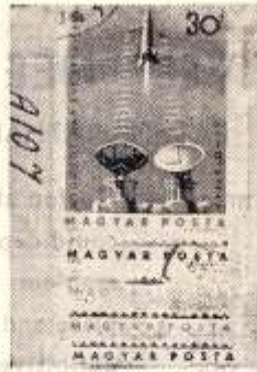
A 107 Hungary 5 values -/75