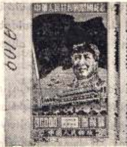
A 109 China 4 values -/50