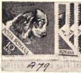
A 79 Roumania 3 values -/40