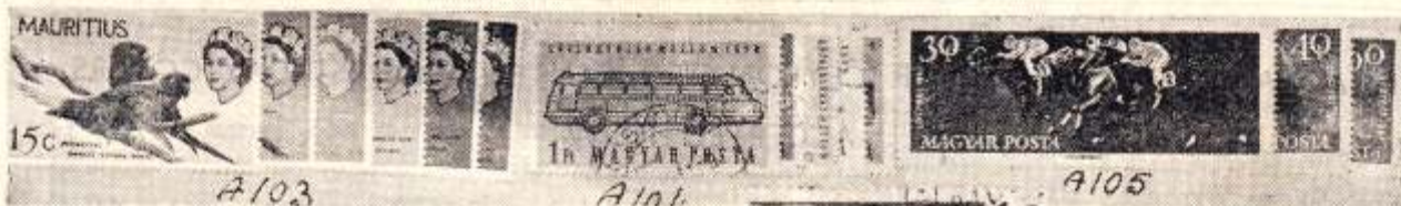
A 103 Mauritius Birds 3 values -/50