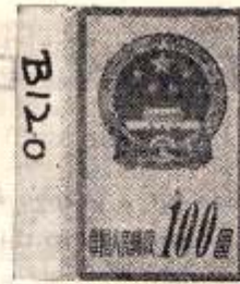
B 120 China 5 values -/50