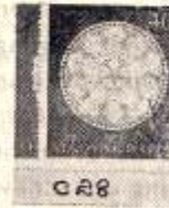
C 28 Hungary 5 values -/75