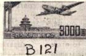
B 121 China 3 values -/50