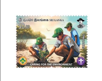
Caring for Environment