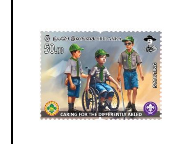
Caring for Differently Abled